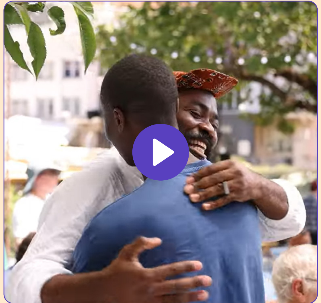
JazzUp – Jazz à Vienne 2023