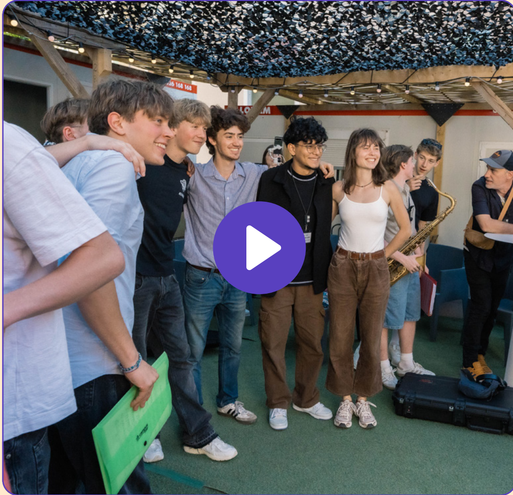
Focus on JazzUp 2025